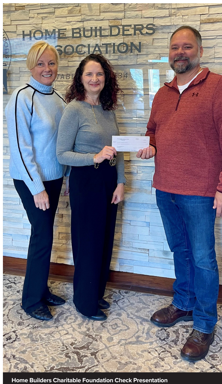
Home Builders Charitable Foundation Check Presentation

Your support continues to drive meaningful change in the lives of low-income seniors. Thank you to our funding partners for helping us make a difference!