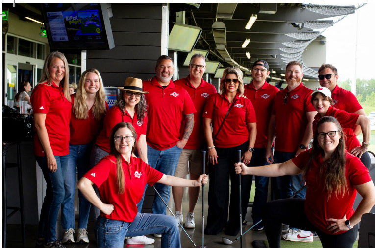
Digital Strike Teams