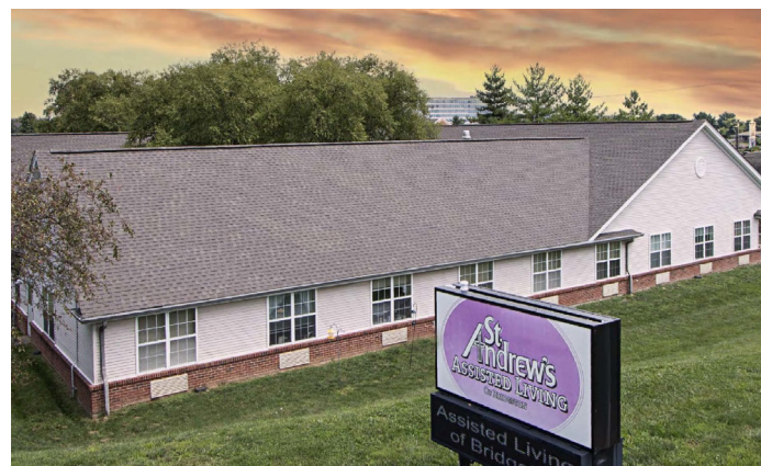
St. Andrew's Charitable Foundation Expands Financial Assistance for Seniors

St. Andrew's Charitable Foundation is pleased to announce the expansion of its financial assistance to seniors living at St. Andrew's properties. We are now providing financial scholarships for five residents of St. Andrew's Assisted Living of Bridgeton. This support enables these individuals to afford the specialized care they need, benefiting both the recipients and their families. Your support of the Foundation allows us to surround seniors and their families with essential care and assistance.