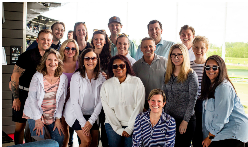
Moneta Group Teams