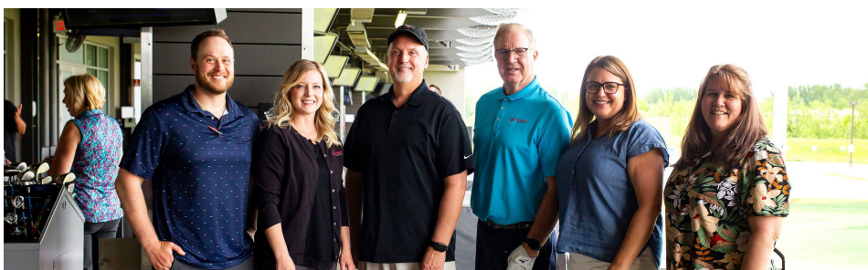
Infinium Pharmacy Team